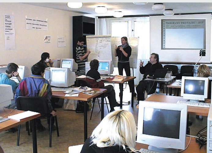
Testing of the newly-developed training materials.

Young hearing-impaired people are one of the most disadvantaged groups in the labour market. Deafness is first of all a communication handicap that makes contact with the hearing majority difficult. And what is worse – the deafness handicap significantly complicates education and training. Laymen largely believe that it is sufficient to teach people with hearing impairments to read and that they are then able to learn using the written texts. However, only experts know that these people generally cannot read. Also, the level of their general education is often low, even if they are normally intelligent. Therefore, their chances in the labour market are already very limited and are shrinking. Technological progress has made many traditional occupations obsolete, where people with a hearing handicap could be employed. On the other hand, technological progress also creates new opportunities. New information and communication technologies, especially the internet, offer attractive possibilities. Moreover, the internet is a nearly ideal medium for the hearing-impaired, because it is mostly visual.