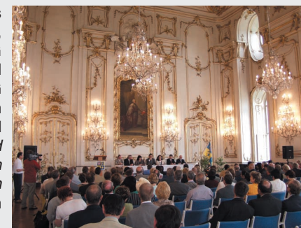
One plenary session of the seminar Lifelong Learning and the Accession of the Czech Republic to the European Union took place in the Assembly Hall of the castle in Kroměříž (Zlín Region, Eastern Moravia).