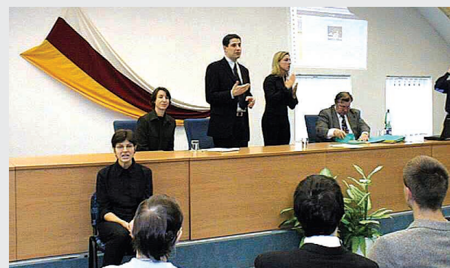
Minister of Informatics, Vladimír Mlynář, at the briefing on the project.

In the last year of the project all texts and methodologies were improved using the results of the testing. They have also been translated into the languages of the partner countries. These newly-developed training materials will be offered to all schools educating people with hearing disabilities and to all employment services organising training courses for job seekers with hearing disabilities.