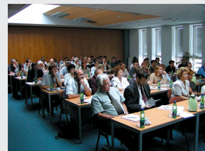
Seminar on the Leonardo da Vinci Programme in Jihlava (Vysočina Region) in May 2003.

The Czech NA (CNA) puts special emphasis on direct contact with the target groups of the Leonardo da Vinci Programme. Therefore, it co-operates permanently with various organisations from the Czech regions, disseminating information on the programme and encouraging potential promoters of new projects. The area of the Czech Republic is divided into 14 regions with an average population of about 730,000 inhabitants. According to the Work Plan of the NA, the staff of the CNA should participate in seminars in seven regions in 2003 and the year after. The real number of regions with joint events of the CNA and regional bodies will be higher, because six regional Leonardo seminars will be organised in 2003 alone.