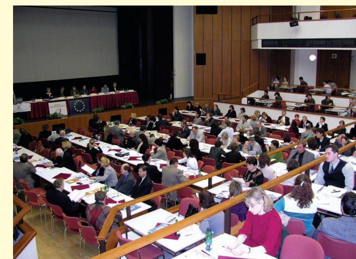
The participants of the Conference on Quality in the Mobility Projects. Prague, 6th March 2003.

All ten awarded projects were presented at the conference so that the participants could better understand the preparation, management and, especially, the impact of these projects. In the final discussion the participants stated that the conference helped to demonstrate the contributions of Leonardo mobility projects and that the awarding of the best projects raised the impact and esteem of mobility projects. The CNA uses and offers its experience gained during mobility project quality assessments within the European work group responsible for mobility project quality.